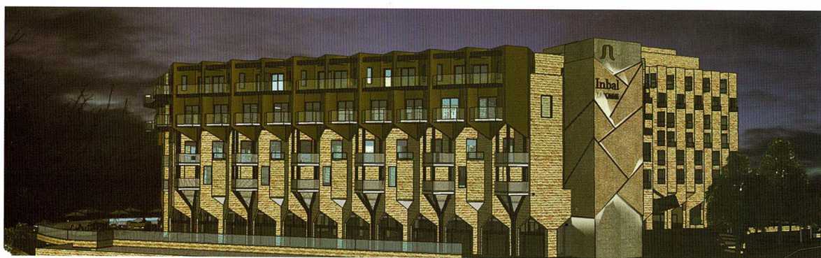
Shimmering & Superlative. An artist's impression of the Inbal at night with the new floors and 51 rooms.

THE VIEWS OF JERUSALEM, DAY OR NIGHT, ARE ALWAYS BREATHTAKING.